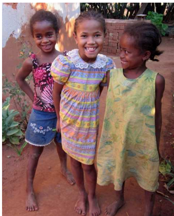
Knowledge and joy of reading for children and youth in Madagascar

We hope that we will be able to come to Germany in July together with our new books to meet the association and the people supporting our work.